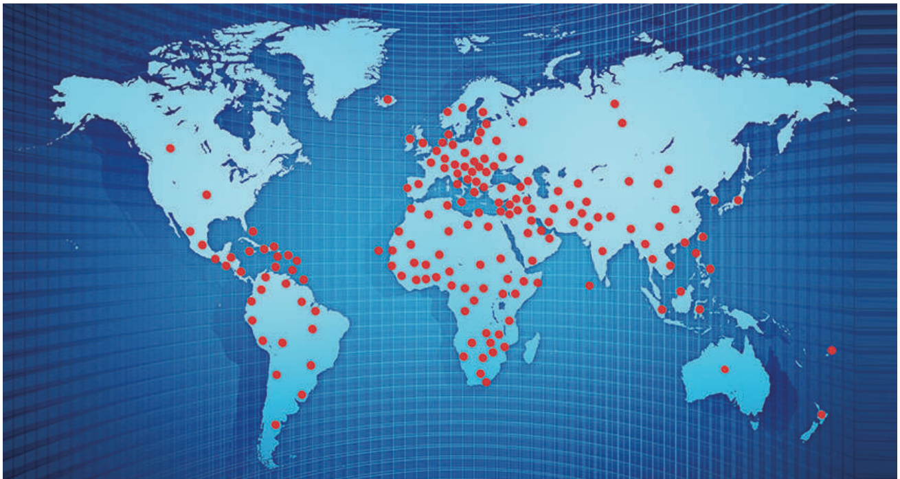
Countries of residence of UNINETTUNO's students

Programmes are in constant further development; for the latest updated informations please consult UNINETTUNO official page: www.uninettunouniversity.net