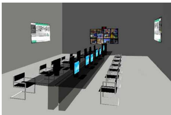
3D model of the Technological Pole

* List of both National and International Poles is contained in the appendix.